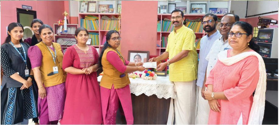
Christos Choir extending their support to Bethlehem Abhaya Bhavan, Koovappady, as part of the 'Chords of Compassion' initiative.