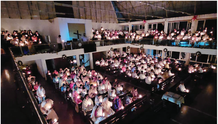
Watch night Service