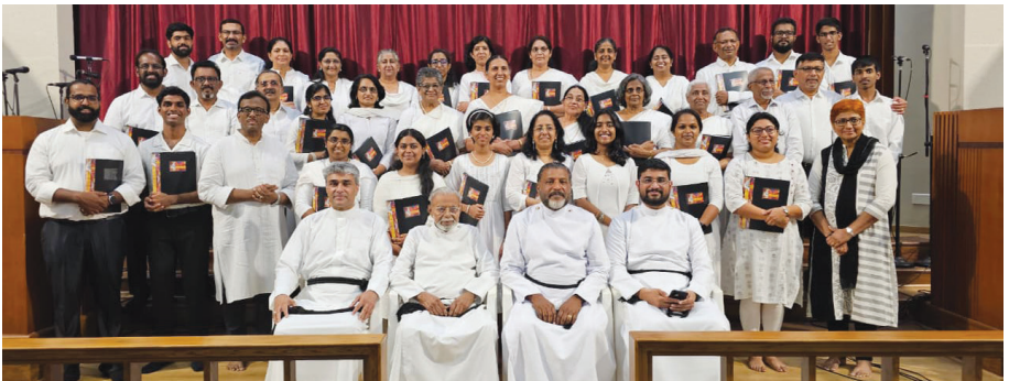
Passion recital on Hosanna Sunday 29/03/2026