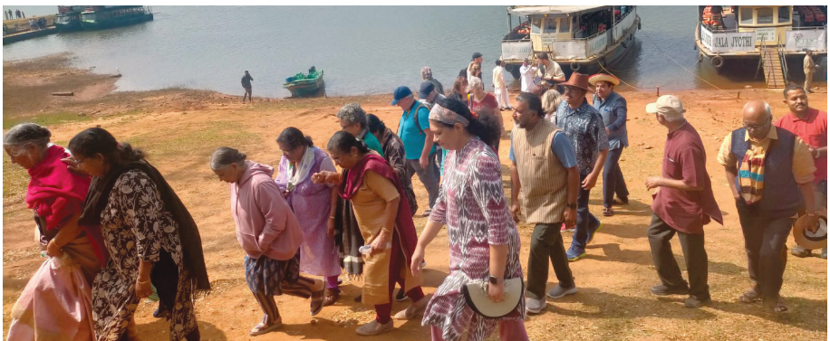
Edavaka Mission Tour